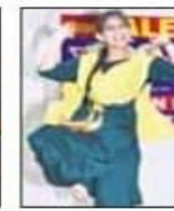
मूल्य कमती छात्रा।