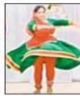
मूल्य कमरती छाया।