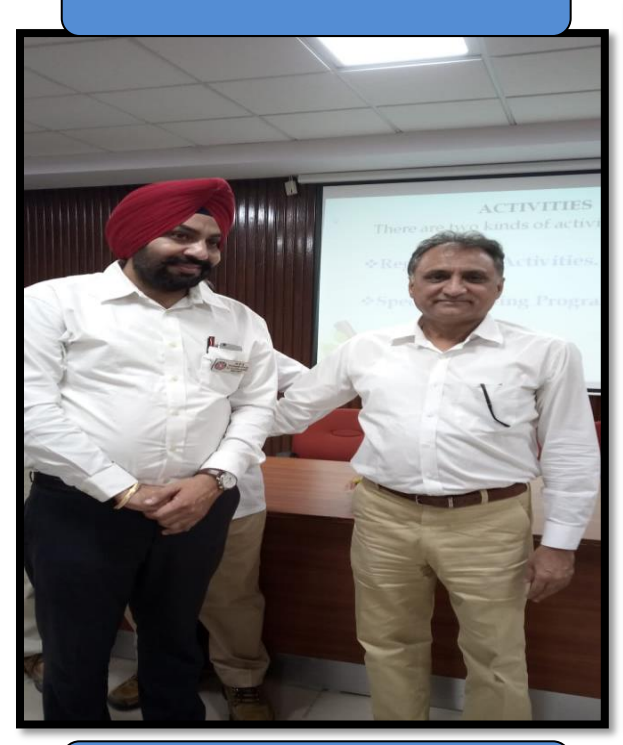
PROGRAMME OFFICER BADEGING 2