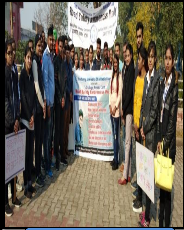
CONCLUSION OF THE RALLY