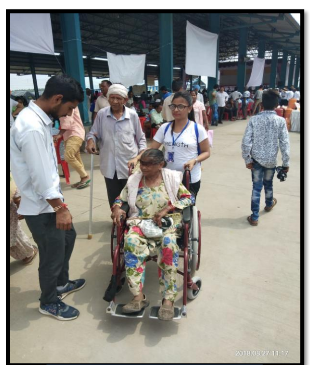
HELP WITH WHEEL CHAIR