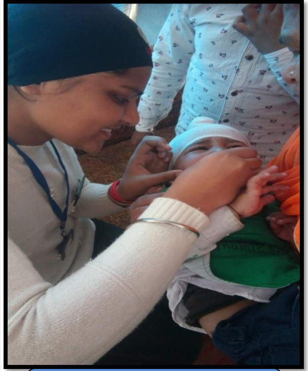
VOLUNTEER IN POLIO CAMPAIGN