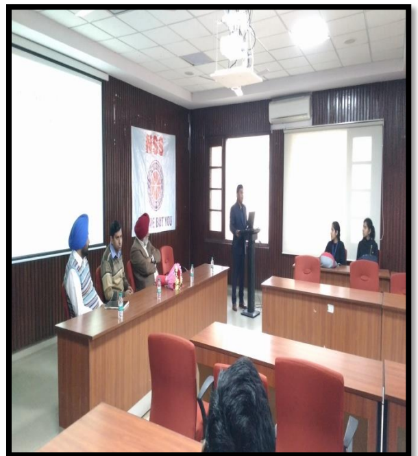
WELCOME OF THE GUEST