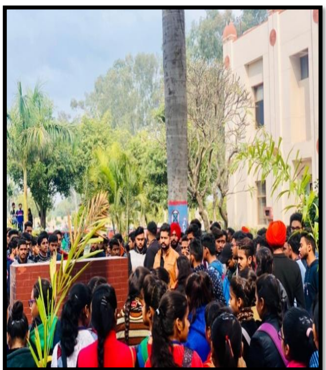
WHOLE COLLEGE PAYING HOMAGE