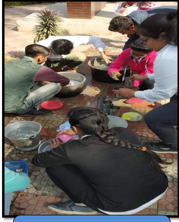
CLEANING AFTER RFRESHMENT