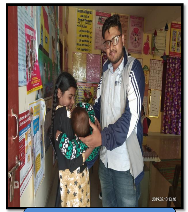
COMMANDER IN POLIO CAMPAIGN 1