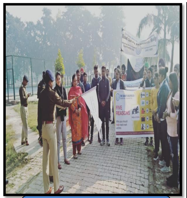
FLAGGING OFF THE RALLY