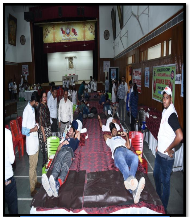
DONORS ON THE TABLE