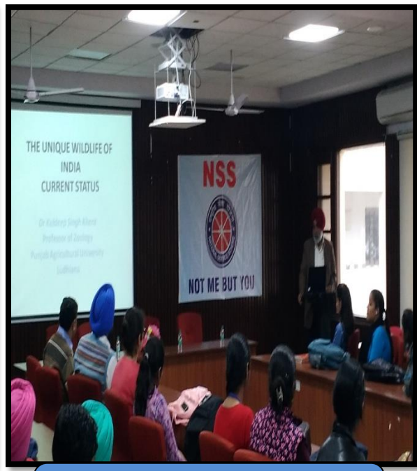
DISCOURSE IN FLOW