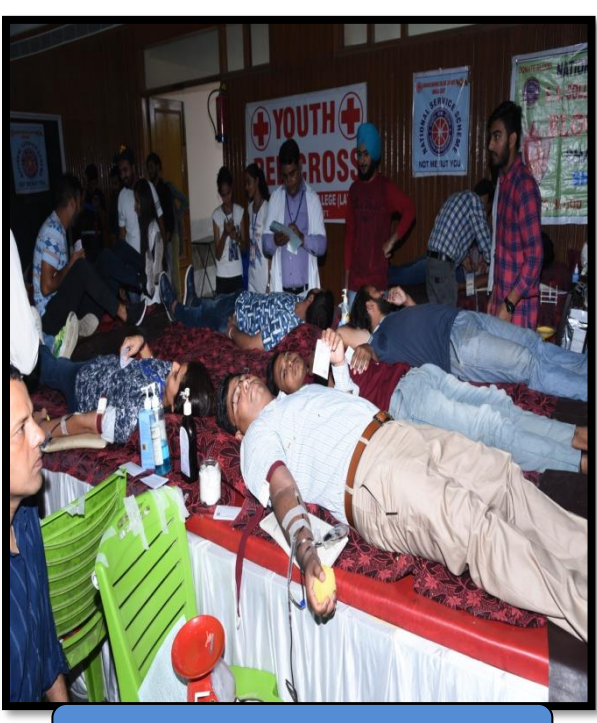
NSSPO DONATING BLOOD