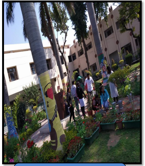
PREPARATION FOR THE DAY