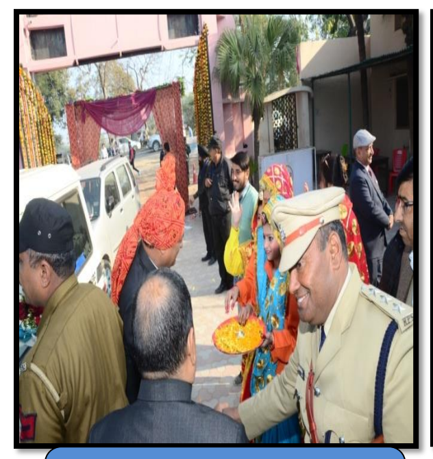
WELCOME OF THE CHIEF GUEST