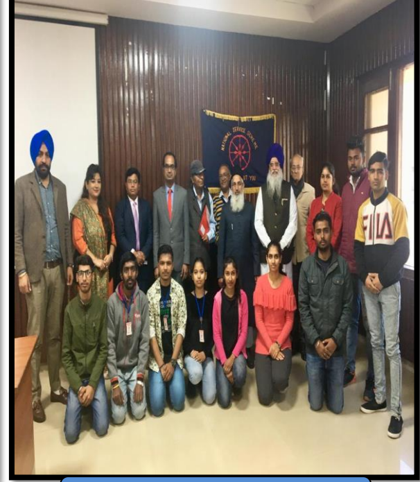
LAST MINUTE PIC