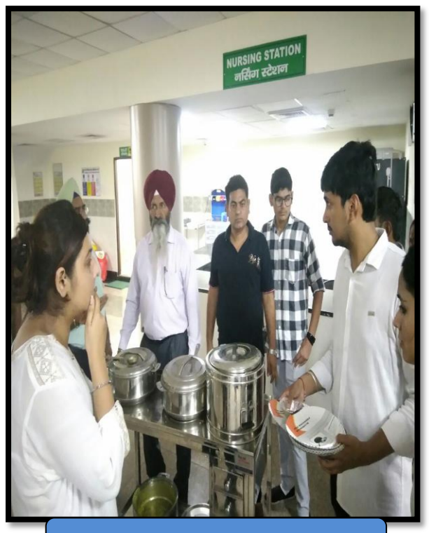
AT CIVIL HOSPITAL 1