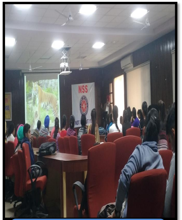
EXPLANATION THROUGH PPT