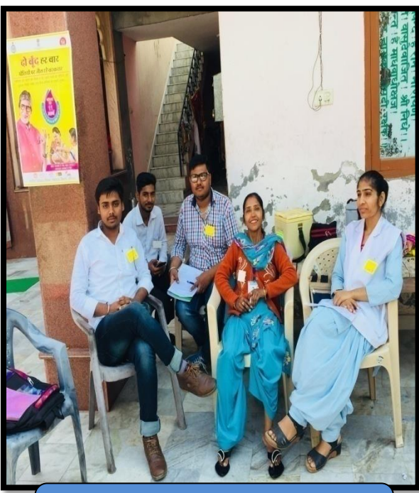
VOLUNTEERS WITH POLIO WORKERS