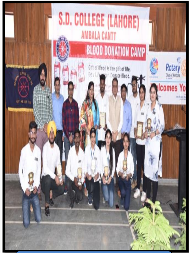
LAST MINUTE PIC