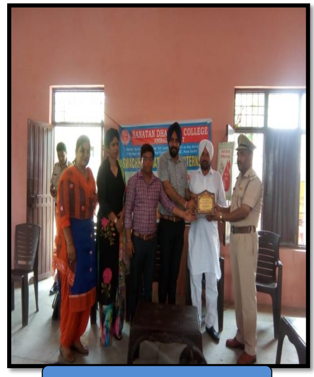
LECTURE OF SHO