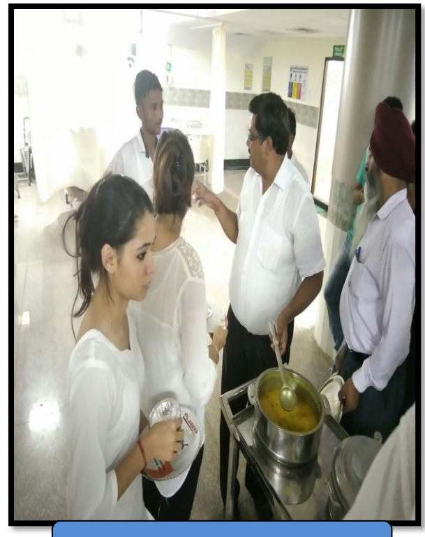
AT CIVIL HOSPITAL 2