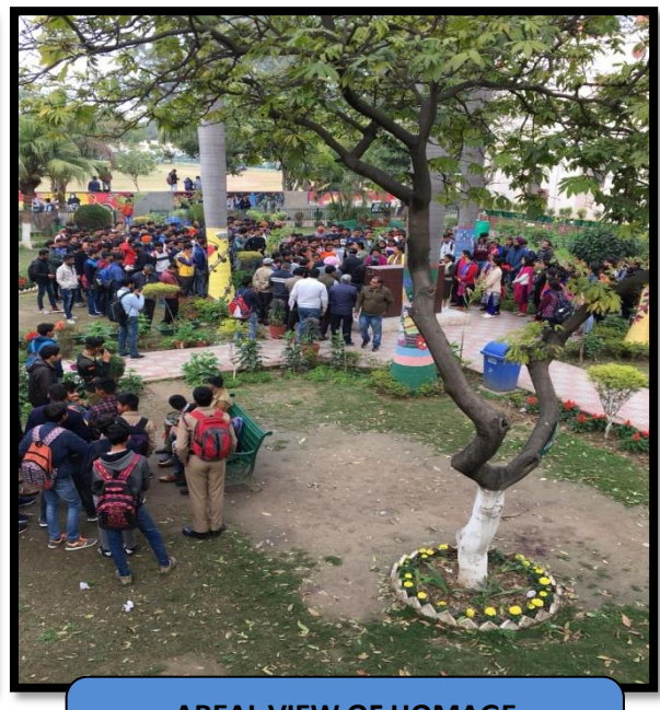
AREAL VIEW OF HOMAGE CEREMONY