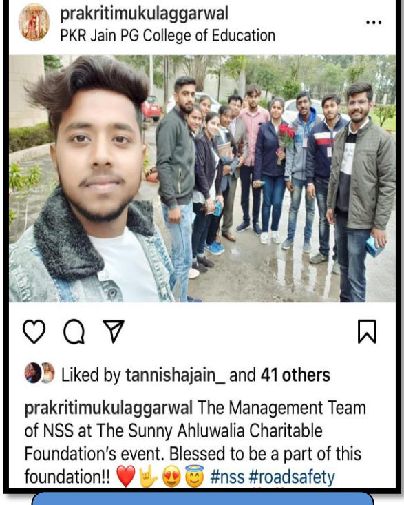
ON SOCIAL MEDIA