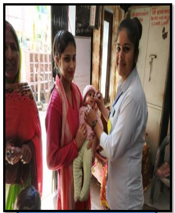
COMMANDER IN POLIO CAMPAIGN 3