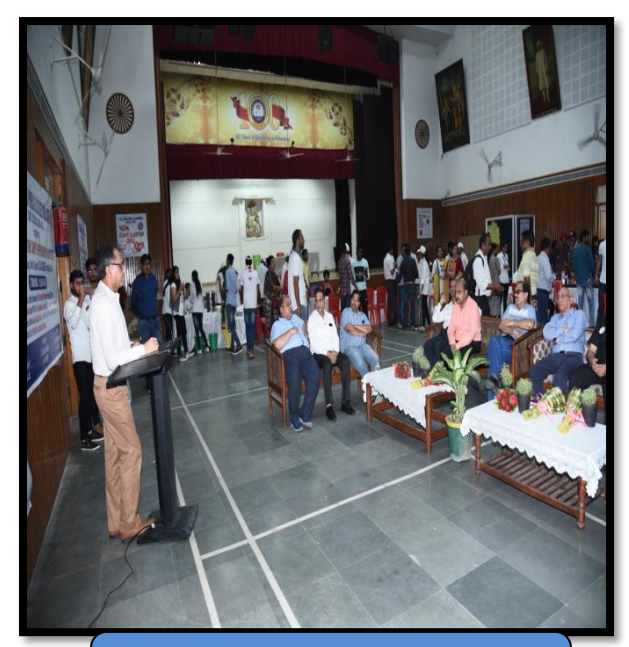
CHIEF GUEST MOTIVATION