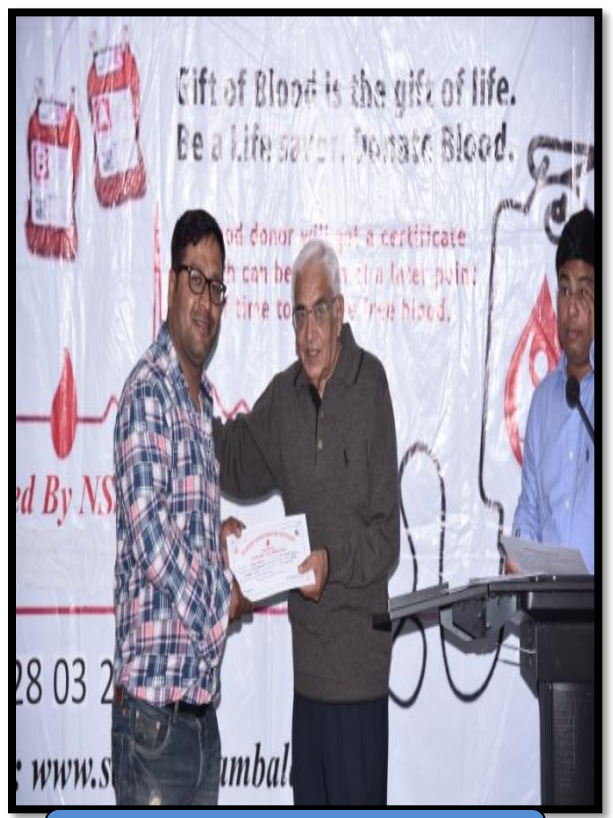
THANKS GIVING TO DONORS