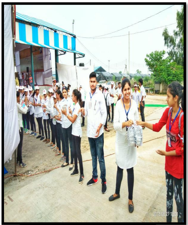
DISTRIBUTION OF FOOD