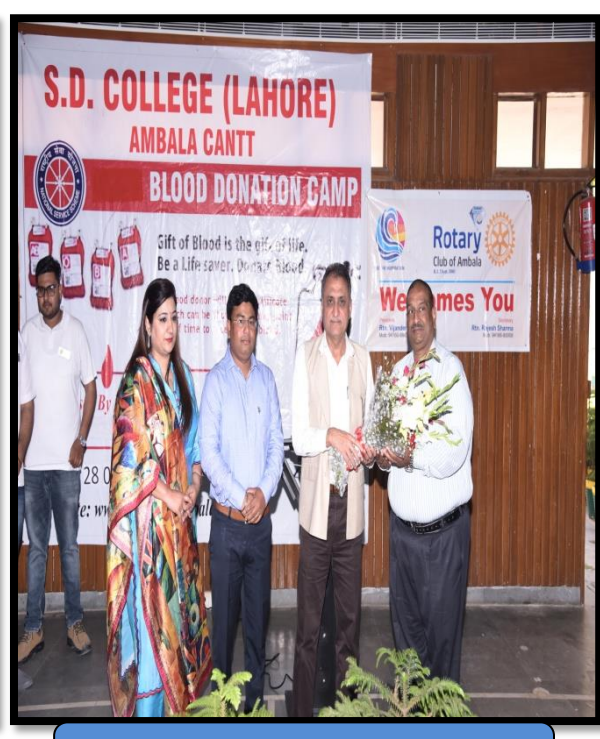
WELCOME OF GUESTS