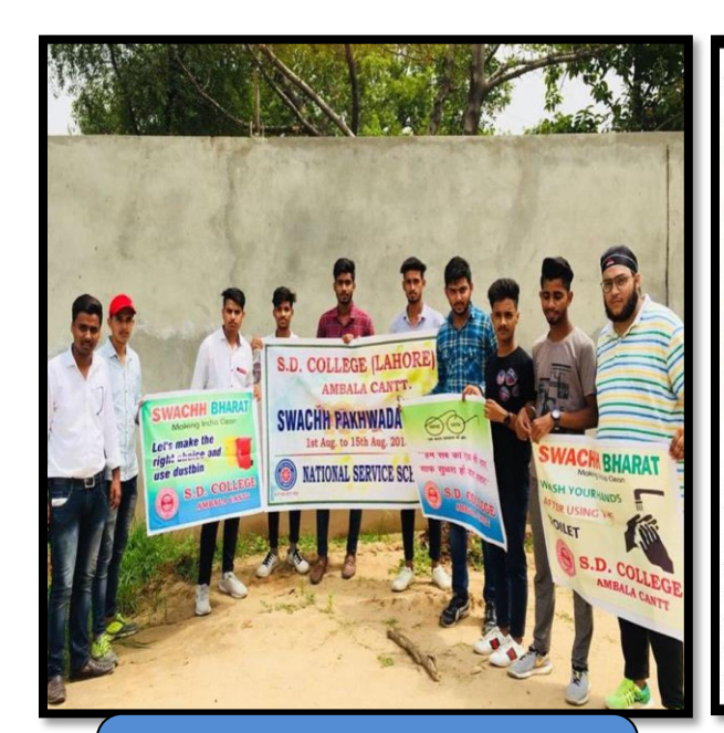
SPREADING MESSAGE OF CLEANLINESS