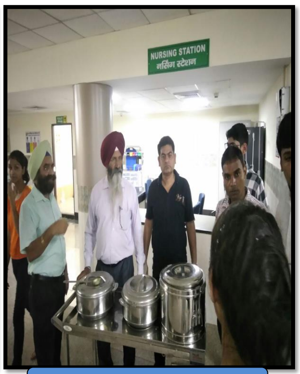
AT CIVIL HOSPITAL 2