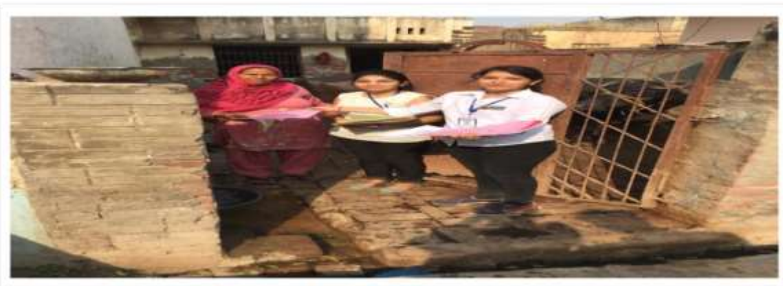
Pamphlet Distribution at Naggal Village

The pamphlets were distributed in Naggal Village and nearby areas on HIV/AIDS awareness, Raktdaan Shankaye aur Niwaran etc. to aware the people about it and removing their myths. It