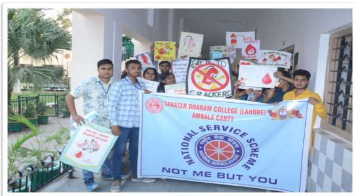
Poster making Competition on Say no to Crackers