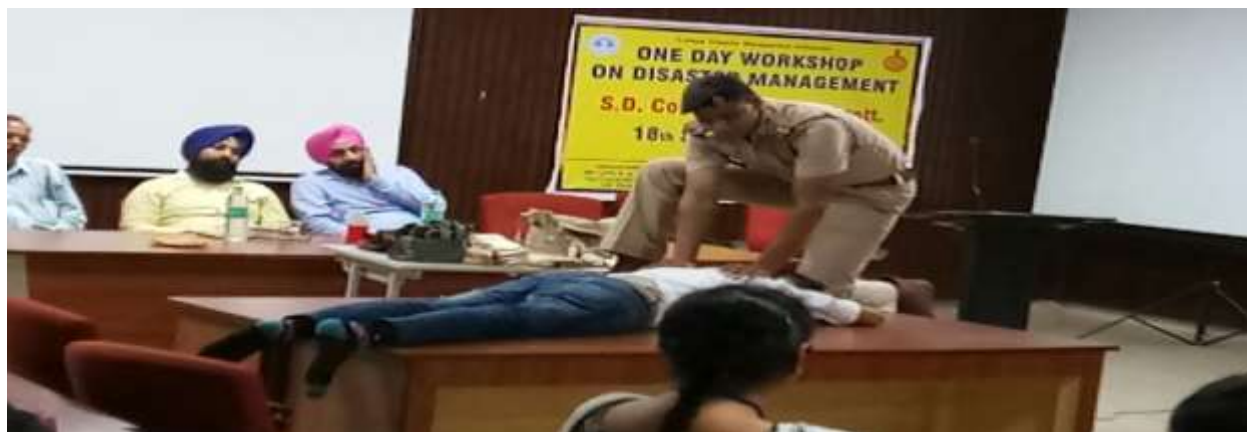
First Aid Training skills given by Disaster Management Authority