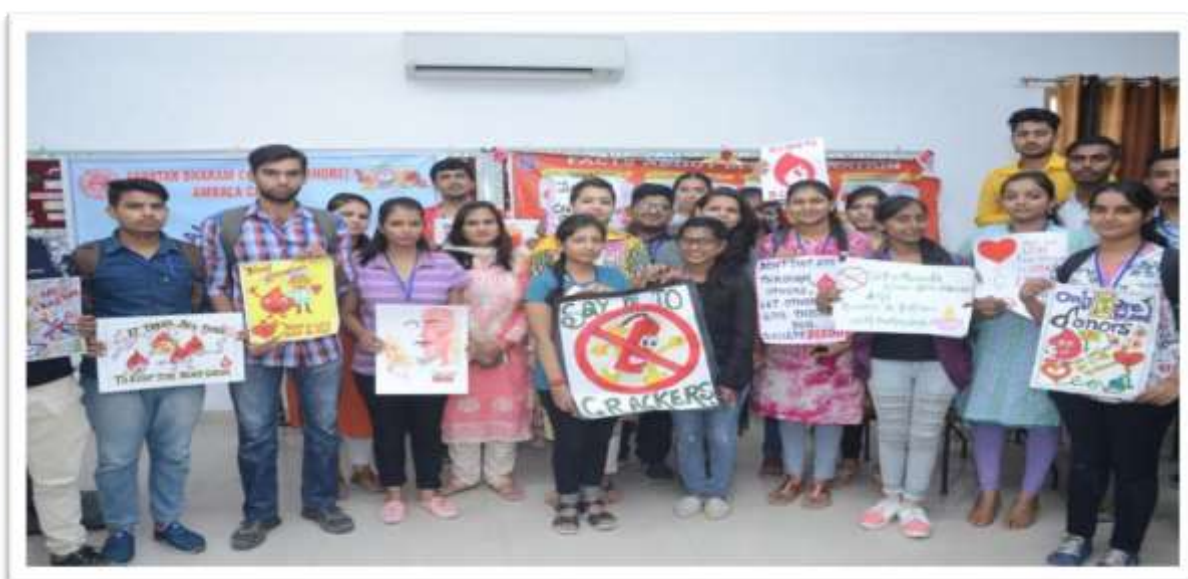
Slogan writing and Poster making on Blood Donation

A poster and slogan making competition on blood donation was conducted by the N.S.S. unit of SD College. This competition was conducted mainly to create awareness among the students to donate blood and to save one's life. The students participated in it with great zeal. The blood donation poster making and slogan making competition brought out the creative side of the students and sensitize the rest through its display at the college notice boards.