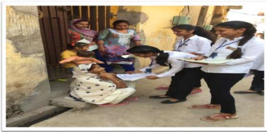
Survey conducted at Naggal Village

A survey was conducted by SD college NSS unit on AIDS to know whether the people were aware about HIV and AIDS. It was conducted in Naggal village, about 100 people filled in the questionnaire containing questions related to AIDS awareness and knowledge.