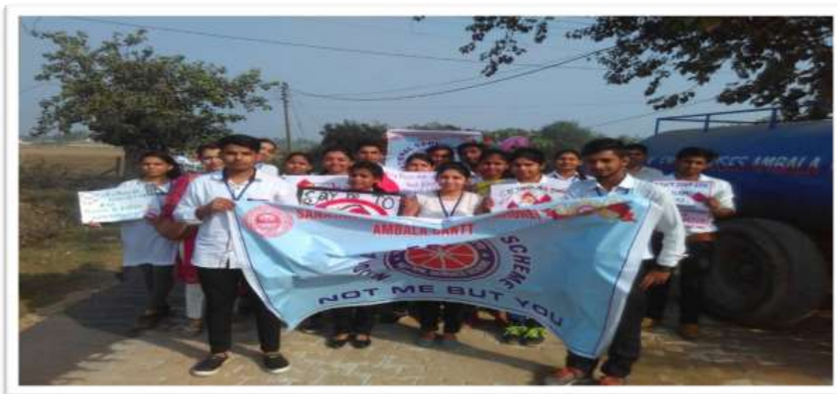
Rally on Blood Donation at Naggal Village

To persuade the people about donating blood our college took out a rally on “Raktdan kar ke Dekho; acha lagta hai”. It was held in college campus, adopted village Naggal and nearby areas. Various slogans were spoken aloud to spread awareness among the people for donating blood. Even the teachers were the essential part of this drive. Students were asked to sensitize the people on donating blood.