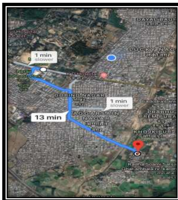
ROUTE MAP OF VILLAGE NAGGAL