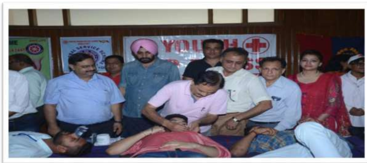
Mini Blood Donation Camp at S.D College Ambala Cantt