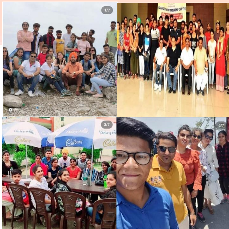
Group photographs of volunteers with teacher In-charge during camp