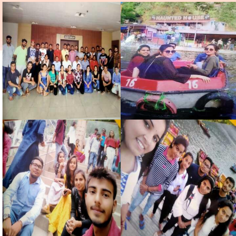
Group photographs of volunteers with teacher In-charge during camp