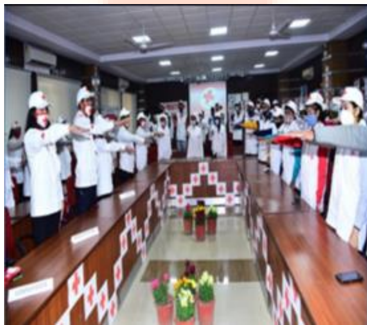
YRC Volunteers taking Oath to Serve the Humanity