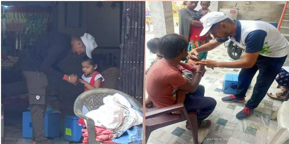
Volunteers giving services in Pulse Polio Program