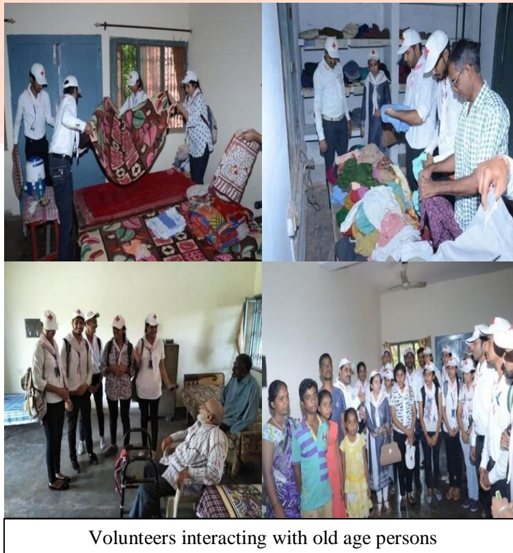
Volunteers interacting with old age persons