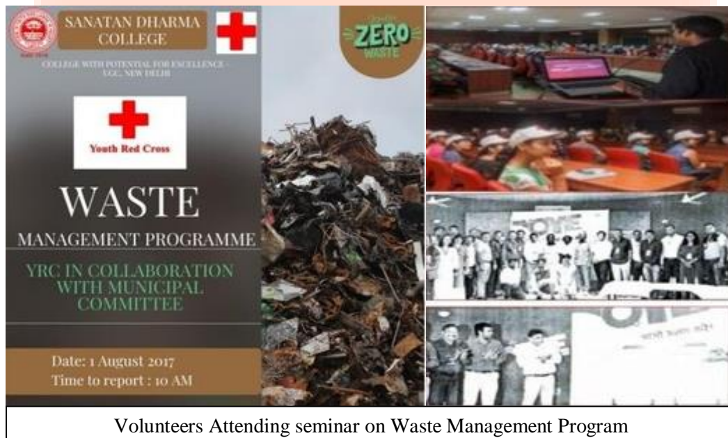
Volunteers Attending seminar on Waste Management Program