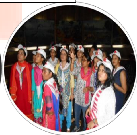
Group photograph volunteers during camp