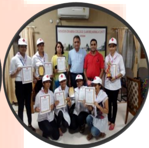
Group photograph of prize winner volunteers