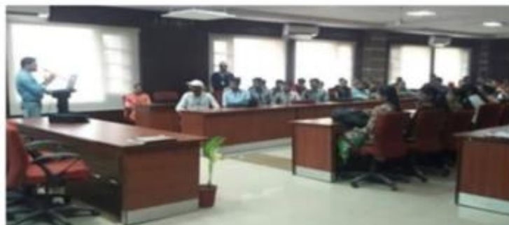
YRC Counselor interacting with students