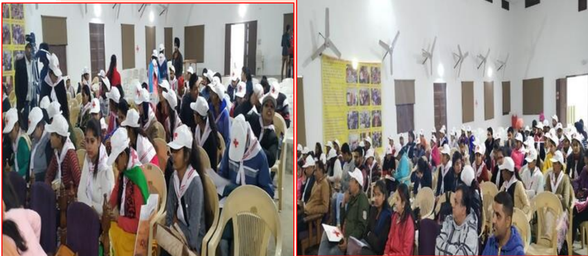
Group photographs of YRC volunteers and counselors of district ambala during camp