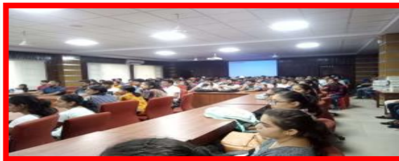
STUDENTS ATTENDING SEMINAR ON INNO WASTE