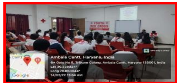
VOLUNTEERS DISTRIBUTED JUTE BAGS IN STUDY CUM TRAINING CAMP AND VOLUNTEERS ATTENDED LECTURE ON ROAD SAFETY