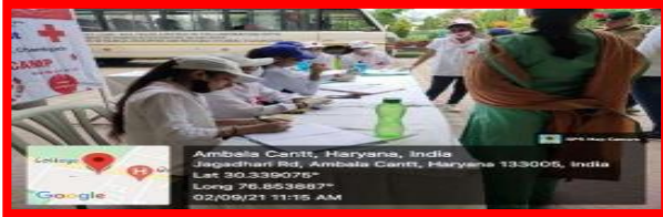
VOLUNTEERS DOING REGISTRATION OF BLOOD DONORS