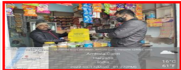
VOLUNTEERS DISTRINBUTING JUTE BAGS