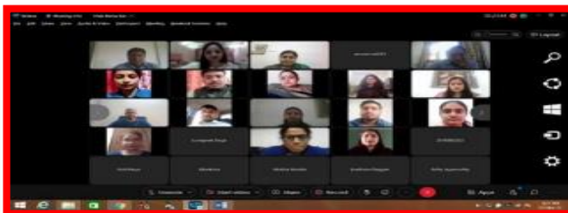
ONLINE NATIONAL SEMINAR ON ROAD SAFETY AWARENESS AND VOLUNTEERS ATTENDED WEBINAR ON ROAD SAFETY AWARENESS