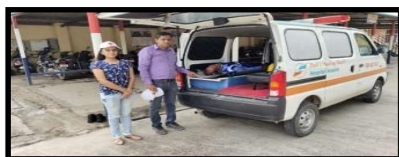
Volunteers attending Emergency Response Drill