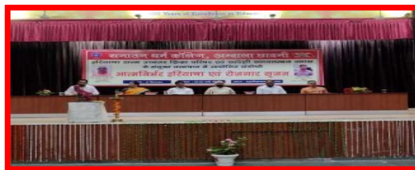
VOLUNTEERS ATTENDING SEMINAR ON ATMANIRBHAR HARYANA AUR ROZGAR SRIJAN