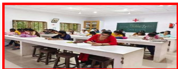
STUDENTS PARTICIPATED IN ESSAY WRITING, POSTER MAKING AND POETRY RECITATION