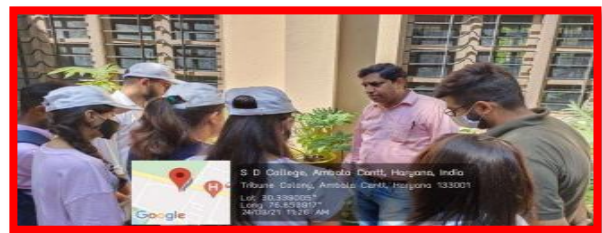
VOLUNTEERS PLANTING TREE