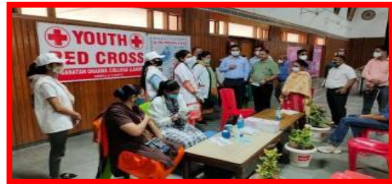
DC SH. VIKAM SING VISITED THE COLLEGE CAMPUS