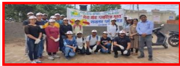
VOLUNTEERS PERFORMED THEIR DUTIES IN CLEANLINESS DRIVE