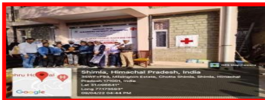
GROUP PHOTO DURING CAMP