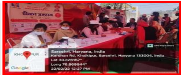
VOLUNTEERS ACTIVELY PARTICIPATED IN FREE HEALTH CHECK UP CAMP IN ADOPTED KHOJKIPUR VILLAGE