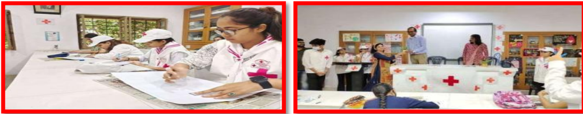
STUDENTS PARTICIPATING IN INTRA COLLEGE POSTER MAKING COMPETITION