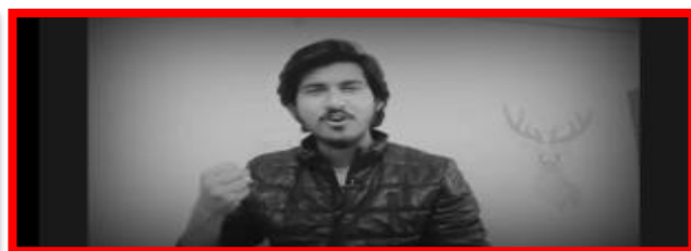
VOLUNTEERS RECITING SLOGAN ON WORLD CANCER DAY