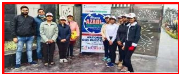
VOLUNTEERS PATICIPATED IN RANGOLI MAKING COMPETITION