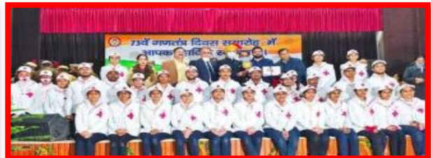
VOLUNTEERS DOING PARADE ON REPUBLIC DAY