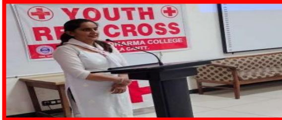
VOLUNTEERS DELIVERING SPEECH