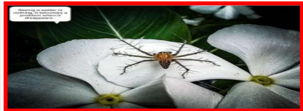
Award Winning Photo of Wild Life Week Celebration