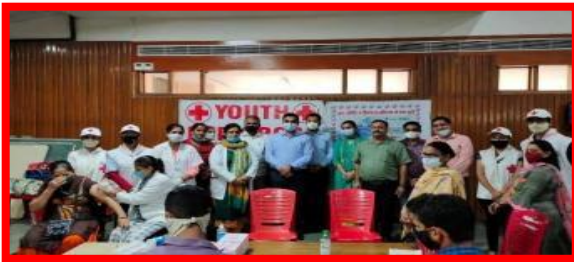
DC SH. VIKAM SING VISITED THE COLLEGE CAMPUS