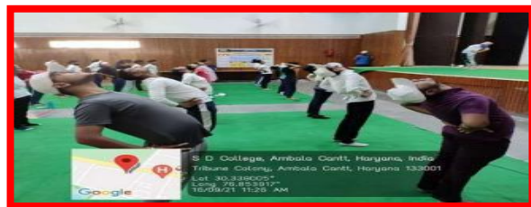
VOLUNTEERS PERFORMING YOGA