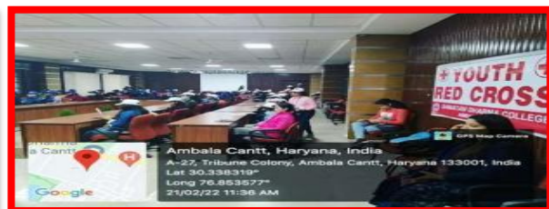
VOLUNTEERS ATTENDED SEMINAR ON INTERGENERATIONAL BONDING