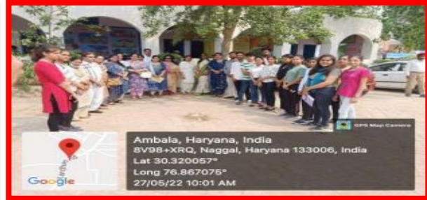
VOLUNTEERS PERFORMED DUTIES DURING HEALTH CHECK UP CAMP