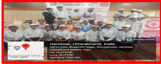
WINNERS AWARDED BY CHIEF GUEST