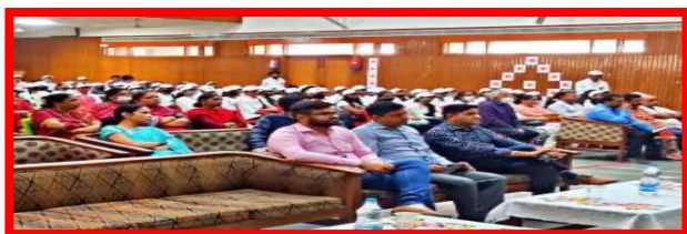
STUDENTS TAKING OATH ON OATH CEREMONY