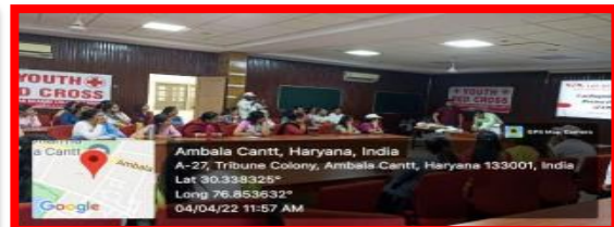
GROUP PHOTO WITH KEYNOTE SPEAKERS