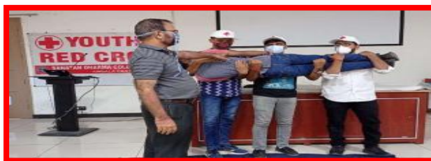
VOLUNTEERS ATTENDING FIRST AID TRAINING