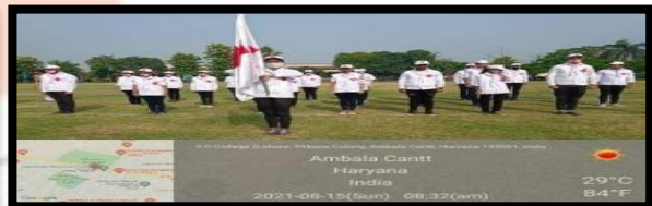
STUDENTS DOING PARADE ON 15 AUGUST 2021