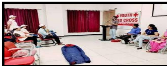
VOLUNTEERS PERSUING FIRST AID TRAINING