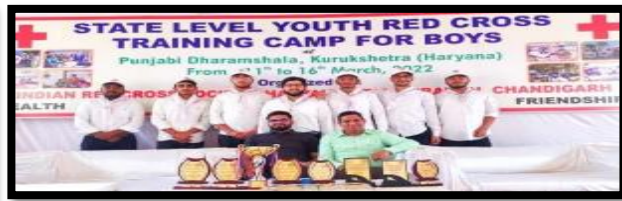
YRC VOLUNTEERS AWARDED BY CHIEF GUEST