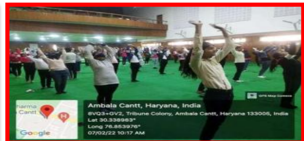
STUDENTS PARTICIPATED IN ONE DAY YOGA CAMP