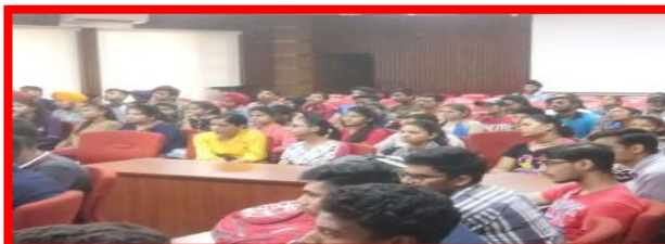
VOLUNTEERS ATTENDING A MOTIVATIONAL LECTURE ON PHYSICAL AND MENTAL HEALTH