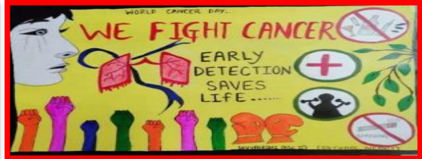
CREATIVITY OF STUDENTS IN COMPETITION