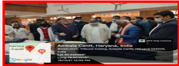
WINNERS HONoured BY THE CHIEF GUEST