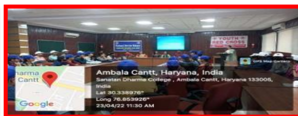
LECTURE DELIVERED BY GUEST