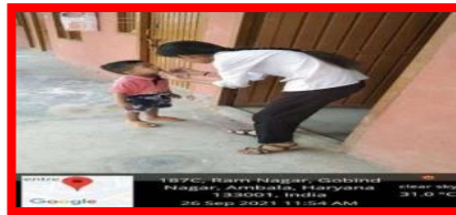
VOLUNTEERS PERFORMED DUTIES IN PULSE POLIO PROGRAM