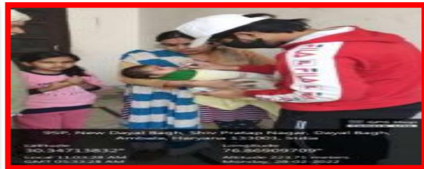
VOLUNTEERS PARTICIPATED IN PULSE POLIO DRIVE